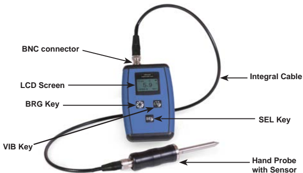
Figure 1. The VBA20