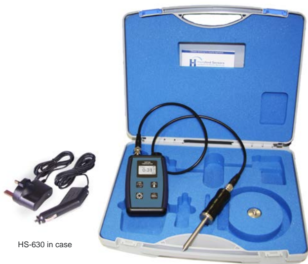
HS-630 in case