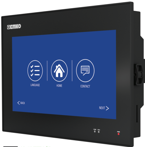
10.1" TFT LCD Touch screen

Multi-language support, Free Type and Windows Font support, Defining user image library, Simulation feature, MQTT communications protocol, SQL client property, VNC remote control feature, SMB file sharing, Video playback feature, C / C ++ real-time programming, BACNET MSTP, MODBUS-RTU / -ASCII (Master / Slave) communication, Communication with SIEMENS, BACKNET IP, OMRON FINS, MODBUS TCP, Compatible with OMRON Host Link, DELTA DVP Series PLCs.