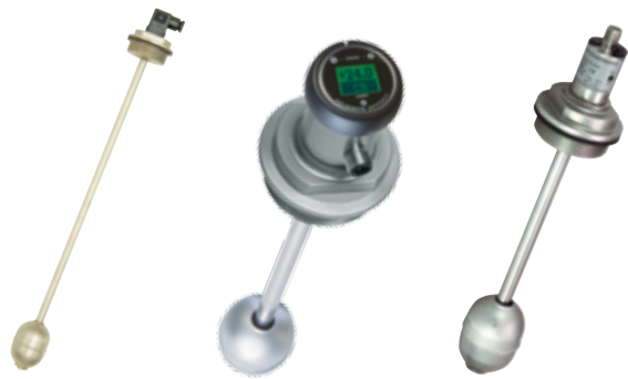
Limit level switch LC/OMNI-LC/FLEX-LC