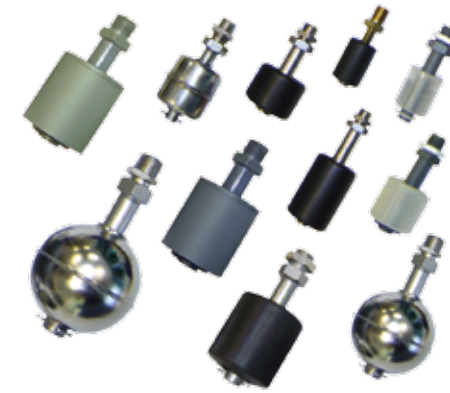
Single-point level switch