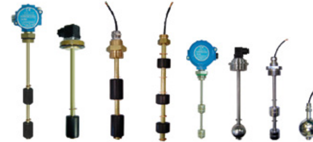
Multipoint-O/S (brass, aluminium and stainless steel)