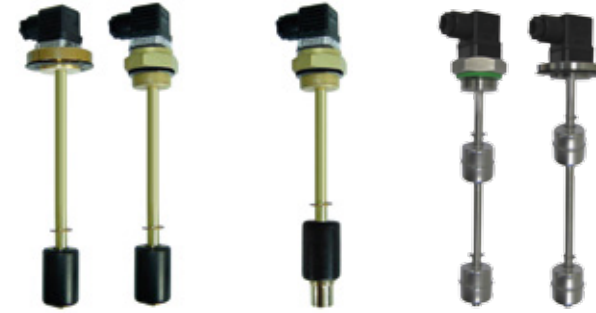
Versions in brass with / without thermometer and stainless steel

Wide variety – we always offer the right sensor for your application.