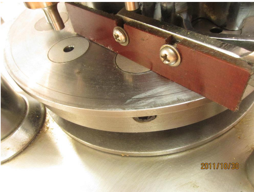
3、 Powder Scraper