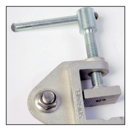
TT-38A Earthing lathe