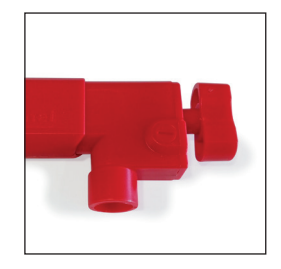
PTA Insulated earth clamp