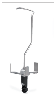
PP-3U MCL Clamp dispenser