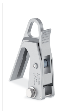
MCL Medium voltage clamp