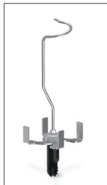
PP-4U MCL Clamp dispenser