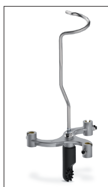
PP-3U Clamp dispenser