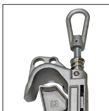
TML Medium voltage clamp