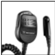
Remote Speaker Microphone PMMN4002