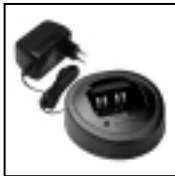
Rapid-rate Desktop Charger PMTN4025