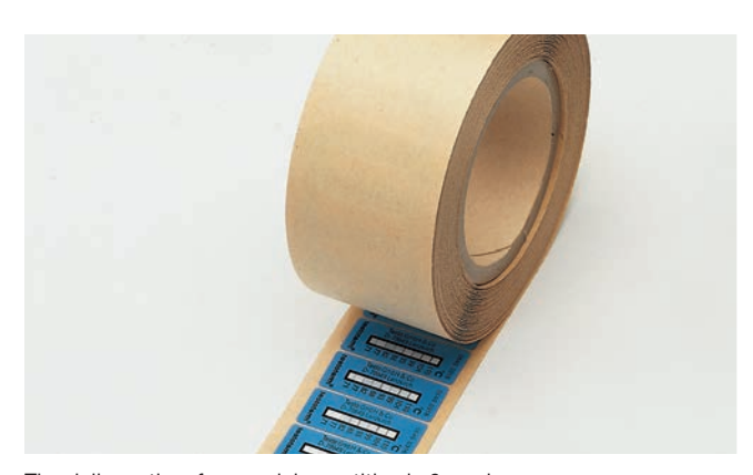
The delivery time for special quantities is 6 weeks.