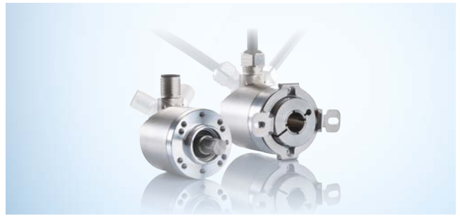
The rotatable male connector and cable outlet enable easy integration even with very limited installation space and reduces the number of encoder variants for different installation scenarios.