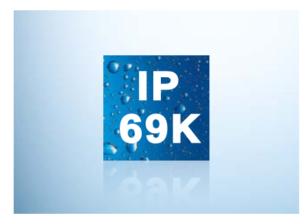
With the IP69K enclosure rating, AHS/AHM36 lnox are suitable for use in machines that are regularly cleaned with shock blowers.