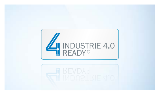
Thanks to remote intelligence, the AHS/AHM36 IO-Link can be successfully integrated into more comprehensive edge computing concepts when implementing Industry 4.0 and the Smart Factory.