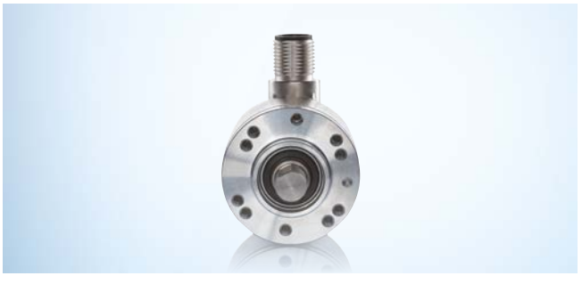
Different mounting hole patterns are available in the face mount flange, and ensure high flexibility for mechanical integration.