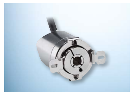
AHS/AHM36 Inox with blind hollow shaft, cable outlet and flexible stator coupling for covering a variety of bolt hole diameters.

Additional information is available at: www.sick.com ▶ AHS/AHM36