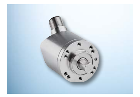
AHS/AHM36 Inox with face mount flange and M12 male connector outlet, as well as impact protection to protect the installed shaft sealing ring.