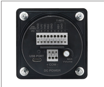
Terminal box for Signal phone for RS485 communication panel(back side)

※ When playing MP3 files, there may be difference of volume depending on user's audio file type.