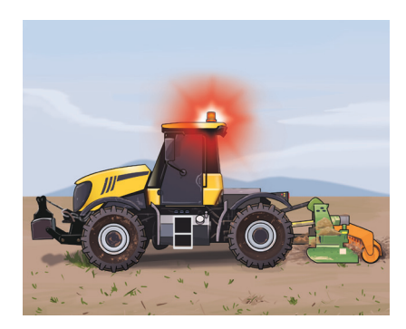
S80NS is sealed by epoxy inside of product. Good performance in poor environments such as high vibration, impact, heavy dust and poor weather.