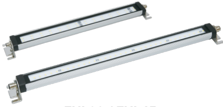
EHL32 / EHL45