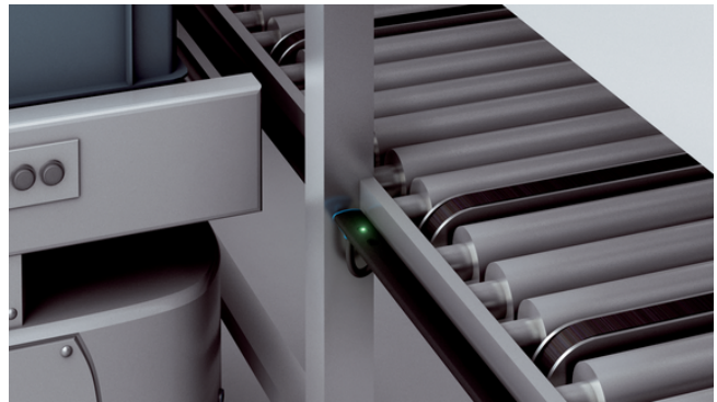
Precise leading edge detection and object overhang detection to decrease conveyor jams and increase efficiency