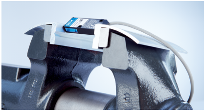
Rugged miniature metal housing