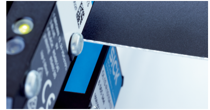
Intuitive alignment thanks to display parameterization and LED alignment aid