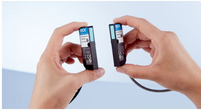
The compact sensor design means it can be used in the tightest of installation spaces