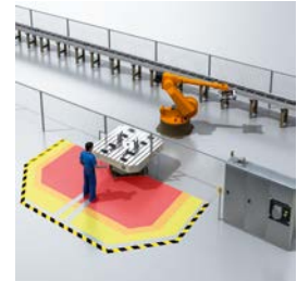
Fig. 5 Person infringes the fields of the scanner.

From a company standpoint, production is lost for the time it takes to reset the machine. Depending on the machine, this can be a complicated process. This would not occur if a warning field has been activated, warning beforehand the unfortunate worker to not come any closer.