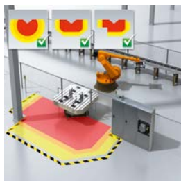
Fig. 4 Safety fields of scanners are freely adjusted to changing surroundings

Safety mats are often limited in use by their initial application. In manufacturing facilities, safety mats are purchased to cover specific machines: for example, one machine setup may require 4 x 4 m mats, while another uses 6 x 6 m mats. In other cases, such as when new machines are bought, an existing operation is moved into new facilities, or floor plans are adjusted within existing facilities. An original safety mat designed for a 4 x 4 m area may then no longer satisfy the requirement. A new safety mat must be purchased or a different one has to be secured from stock.