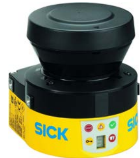
Fig. 1 The Safety Laser Scanner S300 Mini

Since the introduction of safety mats in the 1950s, a host of new technologies have emerged for safety applications, including safety laser scanners in the 1990s. Initially, the argument for safety mats has been that scanners are four times the cost. But now, the initial price point of safety laser scanners has fallen significantly; when total cost-of-ownership is considered, the overall ROI for safety laser scanners is significantly better than safety mats. If you have to replace a safety mat once or twice, you've exceeded the cost of a safety scanner; this doesn't even factor the higher productivity scanners enable. These latter factors are the principal reasons laser scanners have largely supplanted safety mats in the European Union.