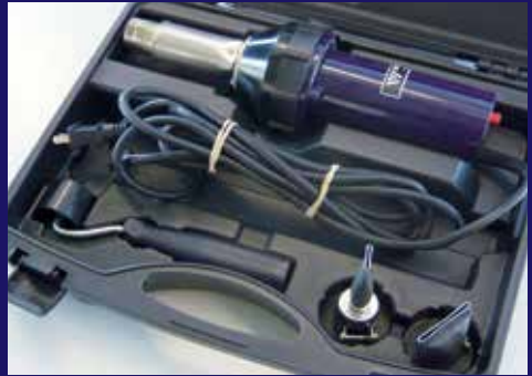
Sturdy case for easy storage (included with purchase)