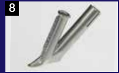
Speed welding nozzle 5 mm