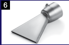
Wide slot nozzle 70 mm