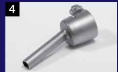
Tubular nozzle 5 mm