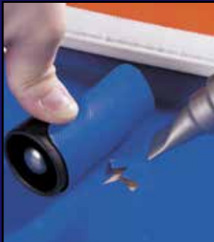
Welding a patch on a tarp