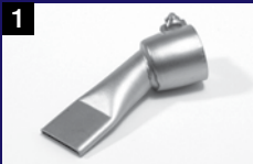
Wide slot nozzle 20 mm