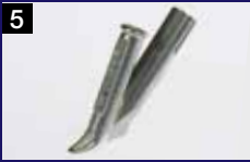
Speed welding nozzle 7 mm, triangle shaped