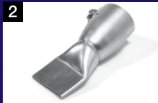
Wide slot nozzle 40 mm