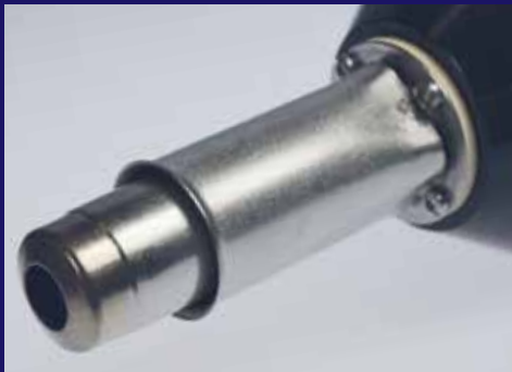
Heating tube protection for more security