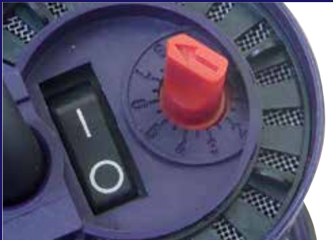
Free adjustable temperature