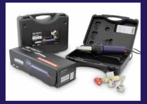
Two different sorts of packaging (card-board box / plastic case) available