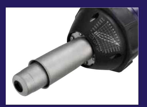
Electronic heating element protection and heating tube protection for more security