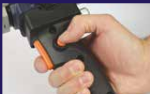
Locking button for continuous extrusion welding with little effort