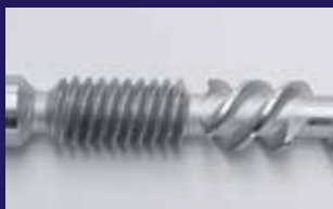
High quality screw for longer lifetime