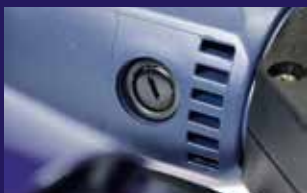
Fast and easily changeable carbon brush