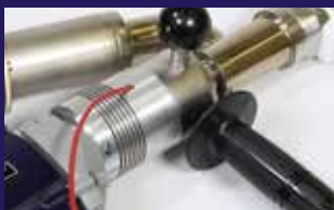
On both sides easy to insert welding rods for flexible welding positions