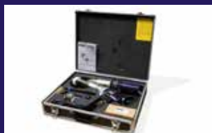
Sturdy box ensures order and dust-free storage (included with purchase)