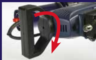
Turnable handle for improved ergonomics