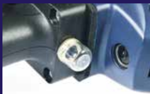
Visible overload protection for more control