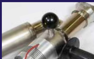
On both sides mountable handle and knobs helps to keep your tool cleaner