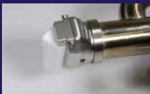
Quickly replaceable and 360° rotatable welding shoes result in high productivity