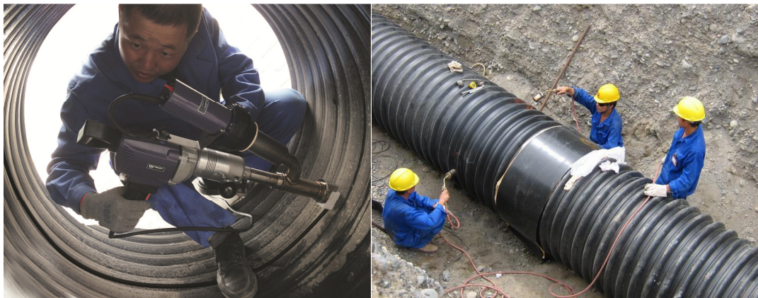
WELDY booster EX2

This pipe system provides different connecting method to match the various demands of reliable sealing and convenient installation preferably. The pipe has many properties relative to other plastic drain pipe, such as reliable water sealing, long service life, flexible and earthquake-proof, less weight, easy and fast installation, etc.