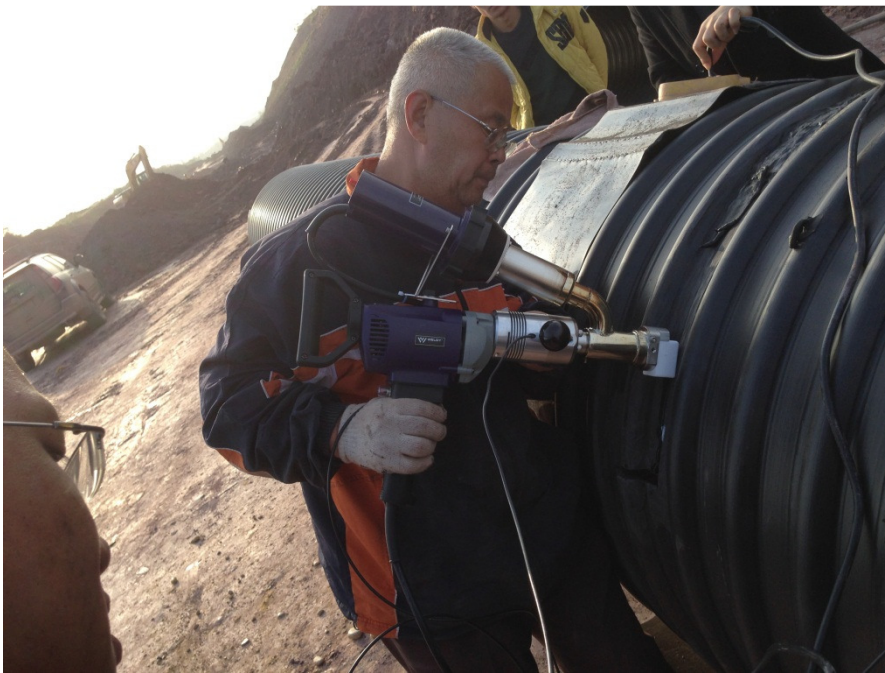
WELDY booster EX2