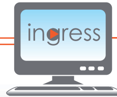
INGRESS SERVER Ingress server connection to access control devices