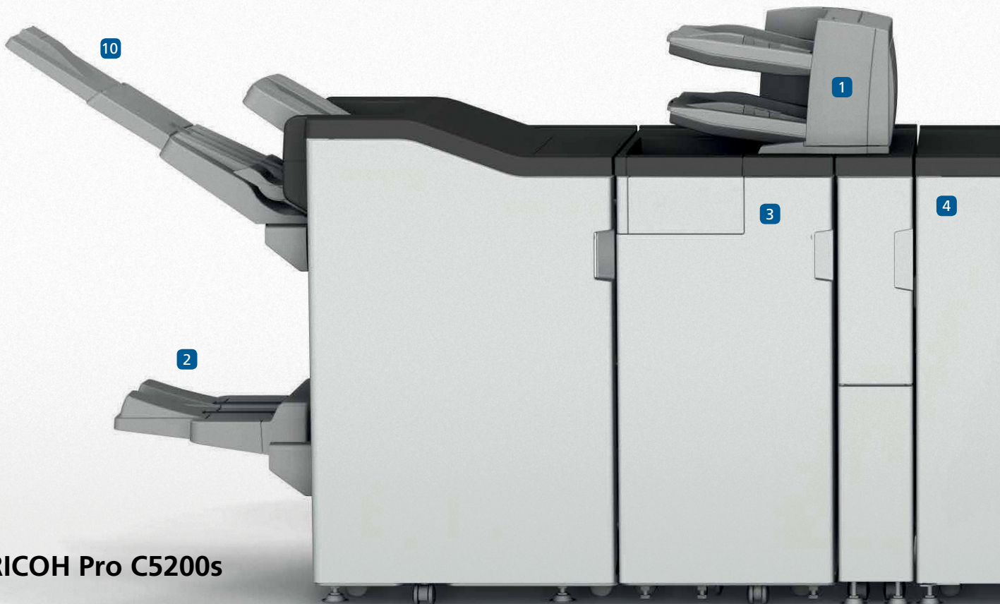
RICOH Pro C5200s