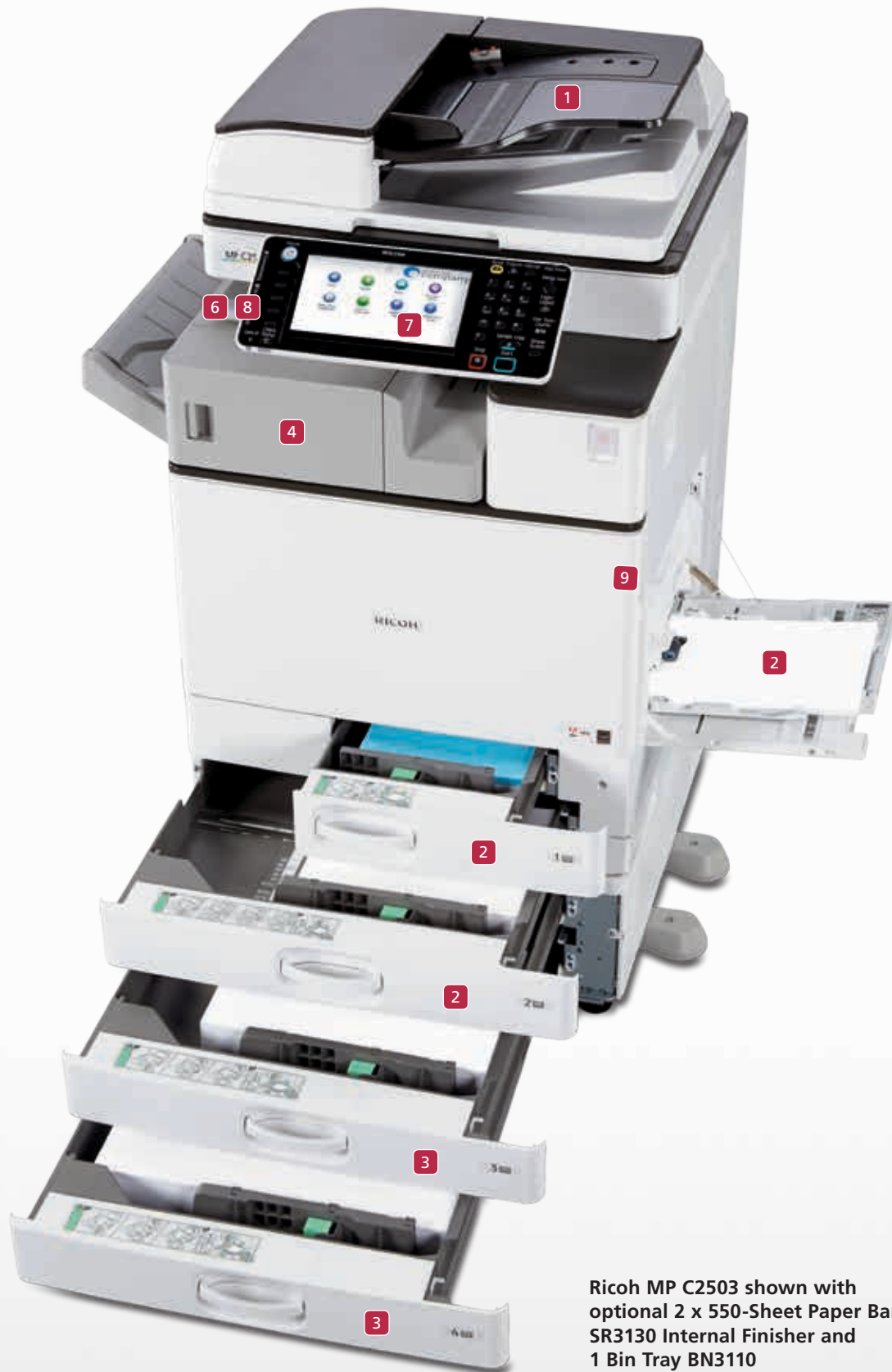
Ricoh MP C2503 shown with optional 2 x 550-Sheet Paper Bank, SR3130 Internal Finisher and 1 Bin Tray BN3110