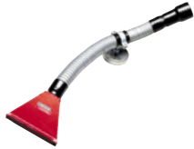
SHFA Flat Suction Nozzle Order K639-5