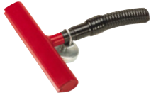
Aluminum Suction 12 in (304.8 mm) Nozzle with Magnetic Mounting Order K639-1