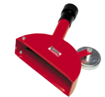
UNM Suction Nozzle for Heavy Smoke Order K639-6