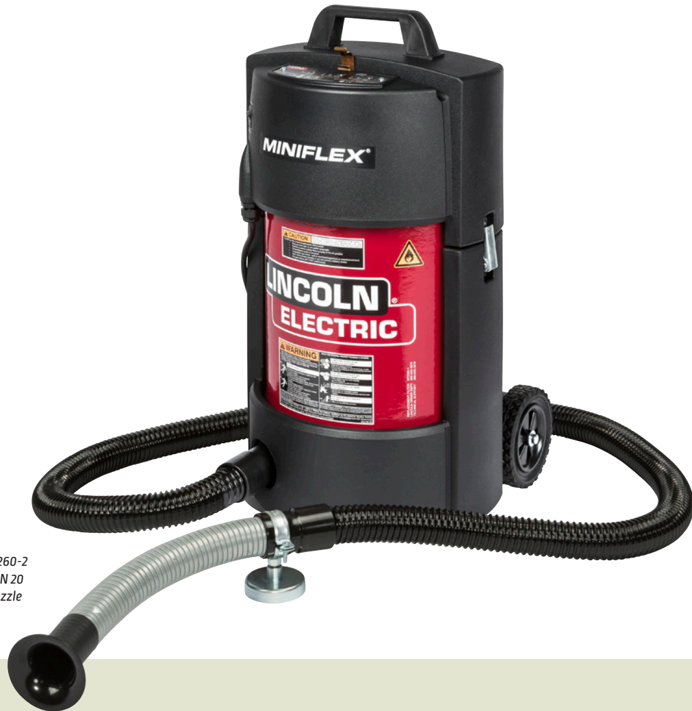
Miniflex® One-Pak® K4260-2 Shown with EN 20 Extraction Nozzle