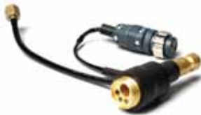
Euro Torch Connection Adapter

K60027-70-4M Work cable with clamp, 70mm 2 , 4M