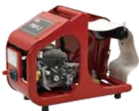
PWF ® -2