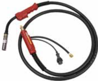
Asia Connector Torch