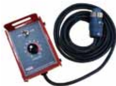
Remote Voltage Control