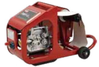
PWF ® -4 Plus