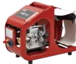
PWF ® -4