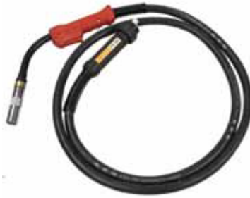
Euro Connector Torch