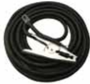
Work Cable With Clamp