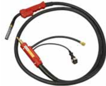
Small Gun Neck Torch

For torch parts selection, please see publication CE101.EN.