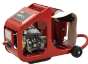
PWF ® -2 Plus