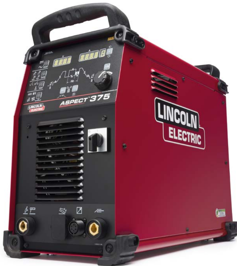
Base Model Shown (K3945-1)