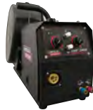
LWF®-34GS Euro-style connection