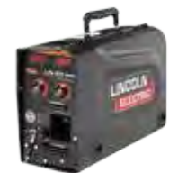
LN - 25 PRO