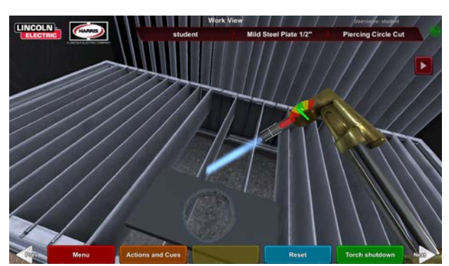
Reinforce Proper Technique