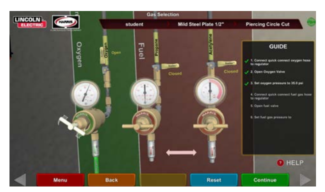
Choose from Multiple Fuels