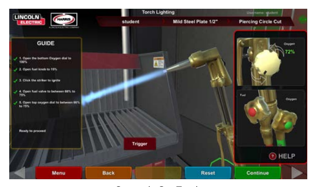
Correctly Set Torch