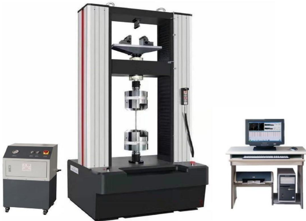
Picture are for reference only, the standard machine is upper tensile