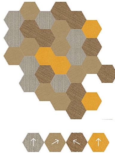
CRYSTAL 03, 04, 10 & PRISM 33