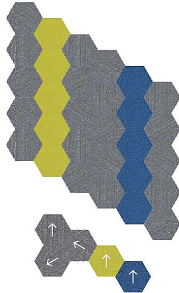
CRYSTAL 09 & PRISM 20, 23