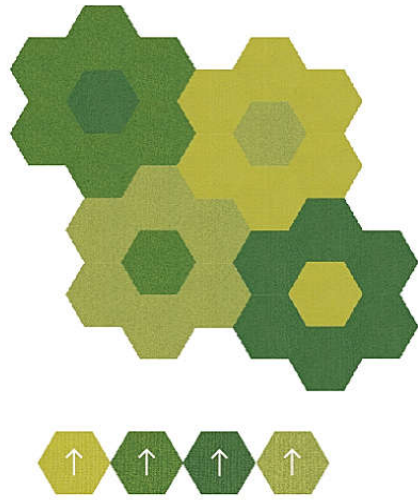
PRISM 20, 21, 22, 38