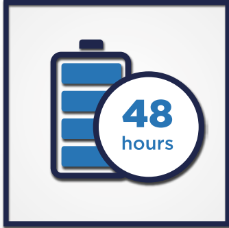
48 hours power backup