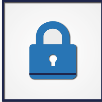
System lock function