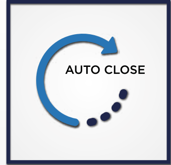
Auto close function