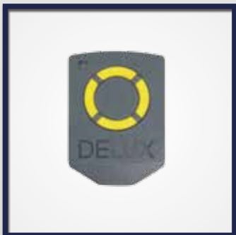
Multifunction remote control