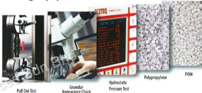
Pull Out Test