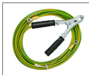
Ground cable GA-00200