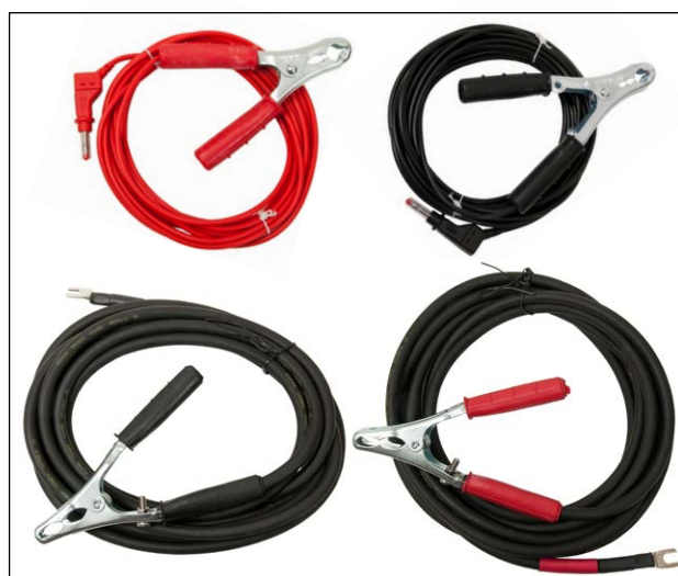
Cable set GA-02053 (two current cables and two sensing cables)