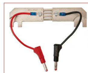
Optional accessory: Calibration shunt BD-90022