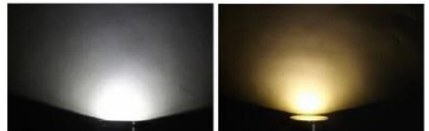
Cool White: 6000-6500K