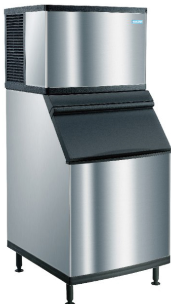
ES-1060 Ice Machine on E-570 Bin