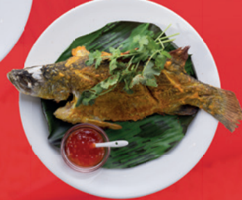
Sea bass 180 sec