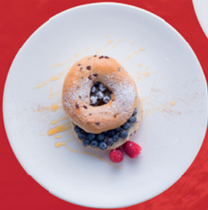
Blueberry bagel 30 sec