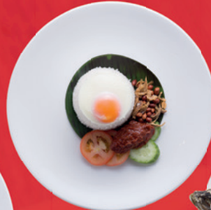
Nasi lemak 75 sec