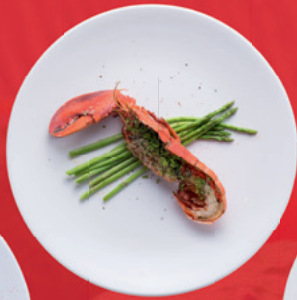
Lobster 60 sec