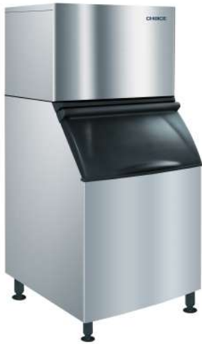
H500 Ice Machine on H530C Bin