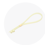
2x plastic straps