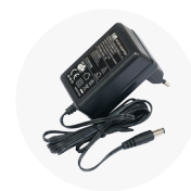
24V 0.8A Power adapter