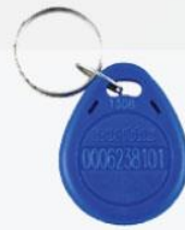
Sticker [RFID Card]