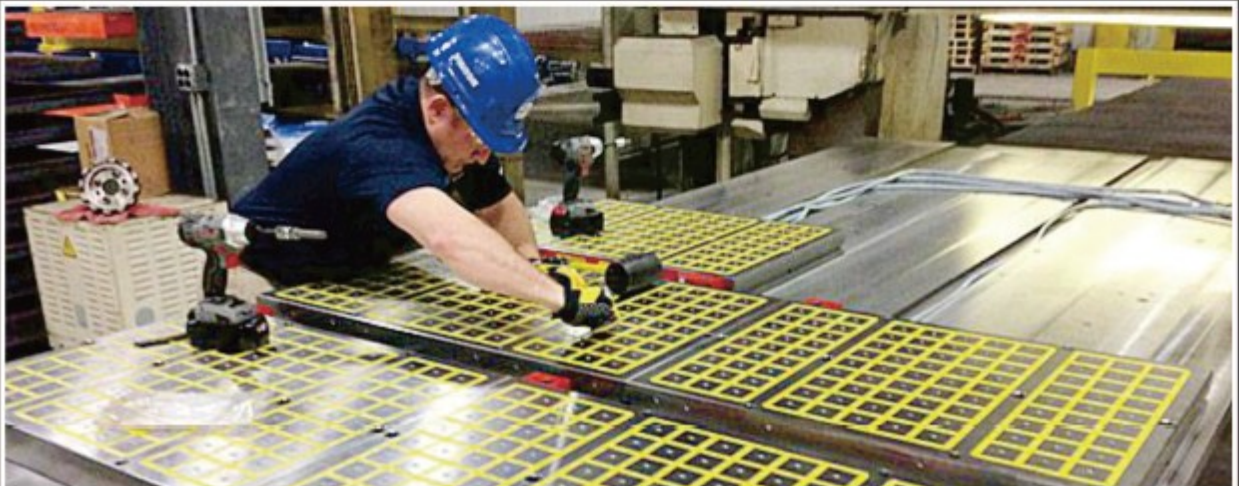
Used on Double Column Machining Center for machining big & multi-medium workpiece 5 sides machining.