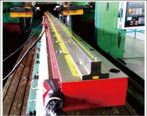
Used for Linear Guideway grinding.