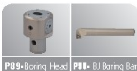
P89-Boring Head P88-BJ Boring Bar