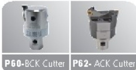
P60-BCK Cutter P62-ACK Cutter