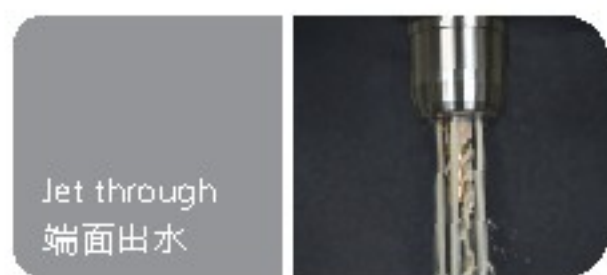
Jet through 端面出水