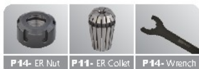
P14- ER Nut