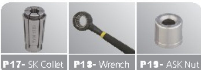
P17- SK Collet