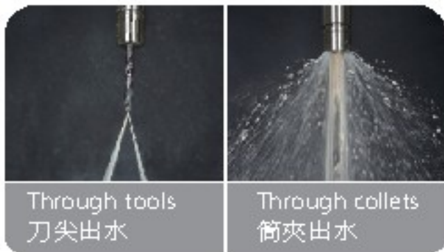
Through tools 刀尖出水