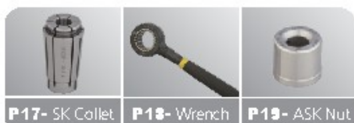
P17- SK Collet