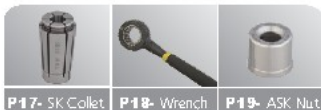
P17- SK Collet P18- Wrench P19- ASK Nut