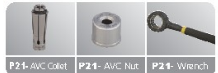
P21- AVC Collet