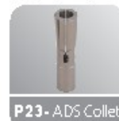
P23- ADS Collet