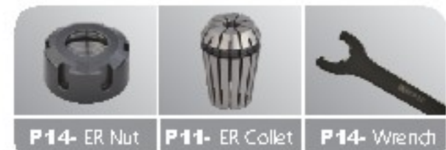
P14- ER Nut