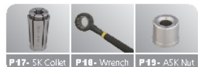
P17- SK Collet